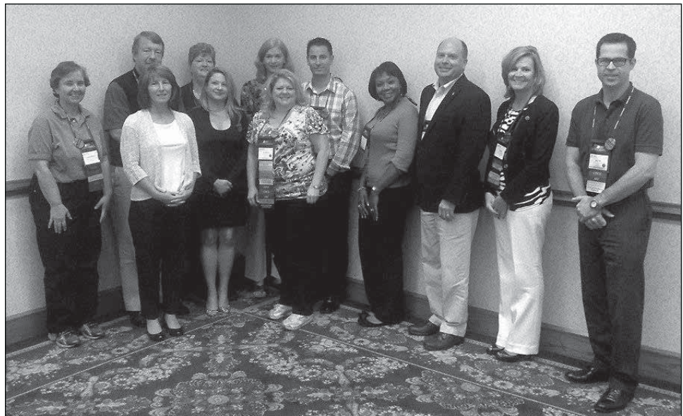
Claims Interest Group Members at the 2013 CPCU Society Annual Meeting