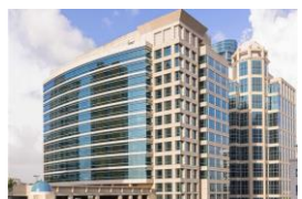
FT. LAUDERDALE, FL